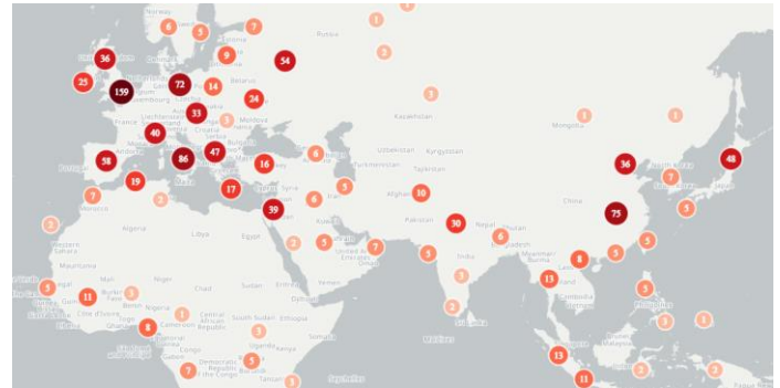
Figure 2 Geolocations mentioned in coronavirus media reports showing clusters of media reports