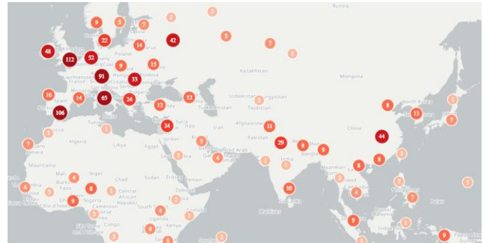
Figure 2 Geolocations mentioned in coronavirus media reports showing clusters of media reports on Italy, France, Spain, Germany, the UK, Russia, India, China, South Korea and Japan