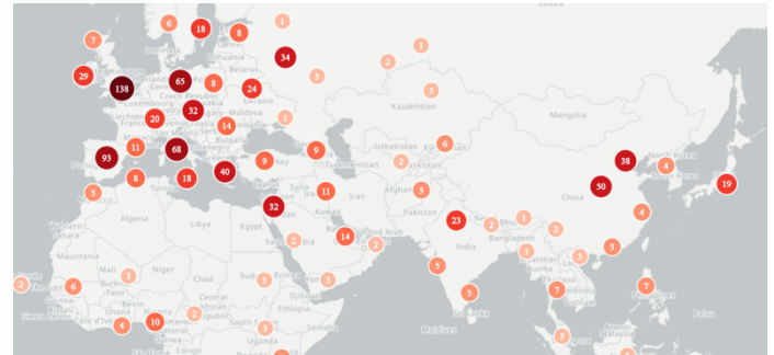
Figure 2 Geolocations mentioned in coronavirus media reports showing clusters of media reports on Italy, France, Spain, Germany, the UK, Russia, Egypt, India, China, South Korea and Japan