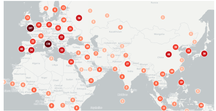
Figure 2 Geolocations mentioned in coronavirus media reports showing clusters of media reports on Italy, France, Spain, Germany, the UK, Russia, Egypt, India, China, South Korea and Japan