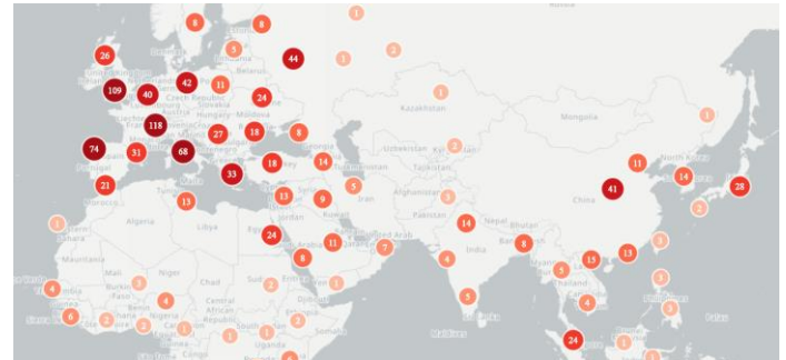
Figure 2 Geolocations mentioned in coronavirus media reports showing clusters of media reports on Italy, France, Spain, Germany, the UK, Russia, Egypt, India, China, South Korea and Japan