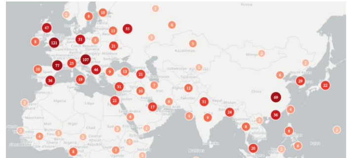
Figure 2 Geolocations mentioned in coronavirus media reports showing clusters of media reports on Italy, France, Spain, Germany, the UK, Russia, Egypt, India, China, South Korea and Japan (source: EMM/MEDISYS)