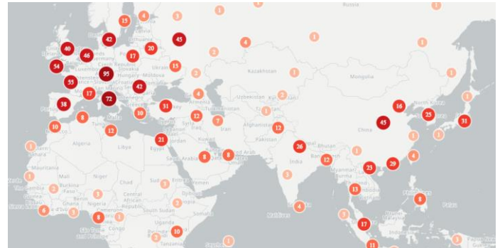
Figure 2 Geolocations mentioned in coronavirus media reports showing clusters of media reports on Italy, France, Spain, Germany, the UK, Russia, Egypt, China, South Korea and Japan (source: EMM/MEDISYS)