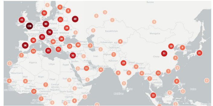
Figure 2 Geolocations mentioned in coronavirus media reports showing large clusters of media reports on Italy, France, Spain, Germany, the UK, Turkey, Russia, India, China, South Korea and Japan