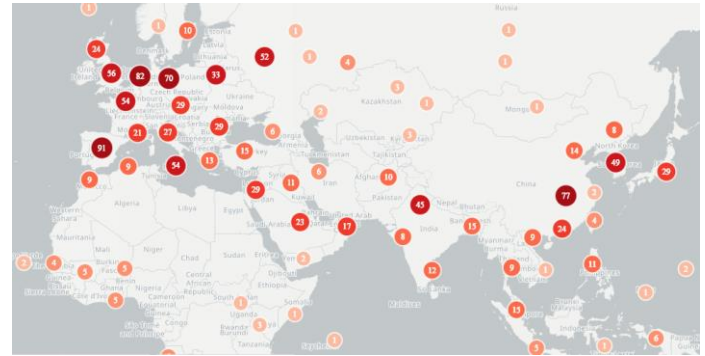
Figure 2 Geolocations mentioned in coronavirus media reports showing large clusters of media reports on Italy, France, Spain, Germany, the UK, Russia, India, China, South Korea and Japan