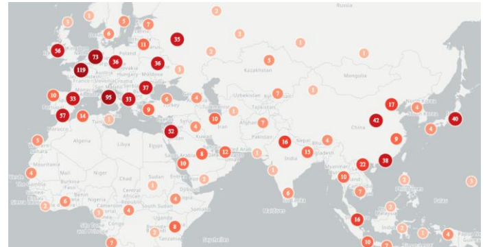
Figure 2 Geolocations mentioned in coronavirus media reports showing clusters of media reports on Italy, France, Spain, Germany, the UK, Russia, India, China, South Korea and Japan