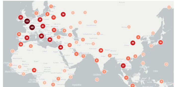
Figure 2 Geolocations mentioned in coronavirus media reports showing clusters of media reports