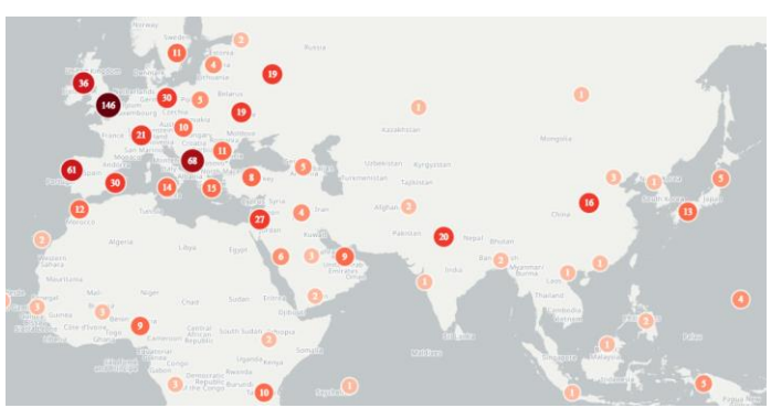
Figure 2 Geolocations mentioned in coronavirus media reports showing clusters of media reports