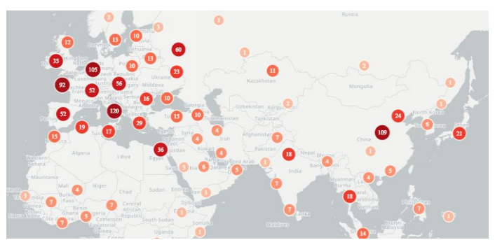
Figure 2 Geolocations mentioned in coronavirus media reports showing large clusters of media reports on Italy, France, Spain, Germany, the UK, Russia, China, South Korea and Japan