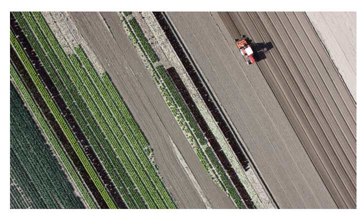
The JRC is responsible for image acquisition in the context of CAP Controls with Remote Sensing (CwRS).

More info: https://ec.europa.eu/jrc/en/research-topic/agricultural-monitoring