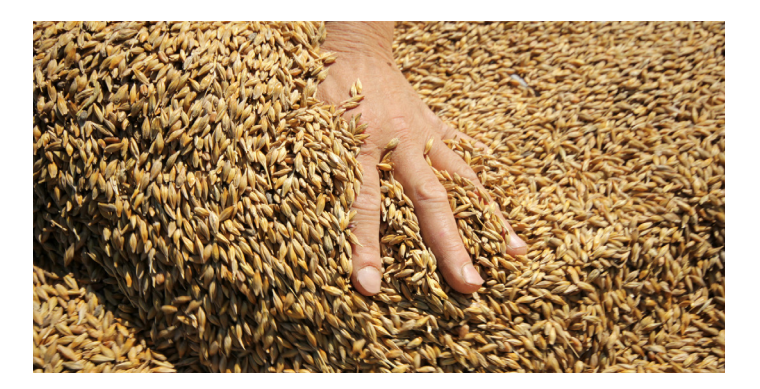
According to the Food and Agriculture Organization (FAO), demand for food is likely to grow by 70% by 2050 as a result of demographic growth and changes in diets and incomes.

More info: http://mars.jrc.ec.europa.eu/mars/About-us/FOODSEC/MARS-Bulletins-for-Food-Security http://spirits.jrc.ec.europa.eu/ • http://www.aphlis.net/