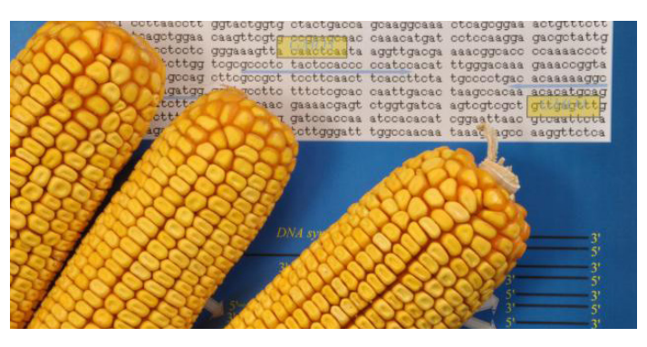
Sustainable intensification of agricultural production through technological development is high on the agenda of governments and international bodies.

https://ec.europa.eu/jrc/en/network-bureau/european-coexistence-bureau-ecob