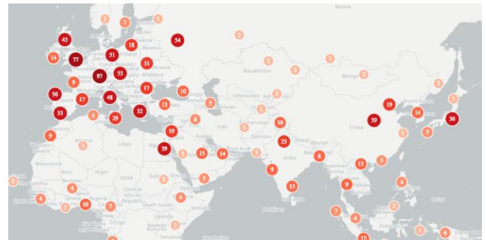
Figure 2 Geolocations mentioned in coronavirus media reports showing clusters of media reports on Italy, France, Spain, Germany, the UK, Russia, Egypt, India, China, South Korea and Japan