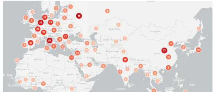
Figure 2 Geolocations mentioned in coronavirus media reports showing large clusters of media reports on Italy, France, Spain, Germany, the UK, Russia, Egypt, India, China, South Korea and Japan