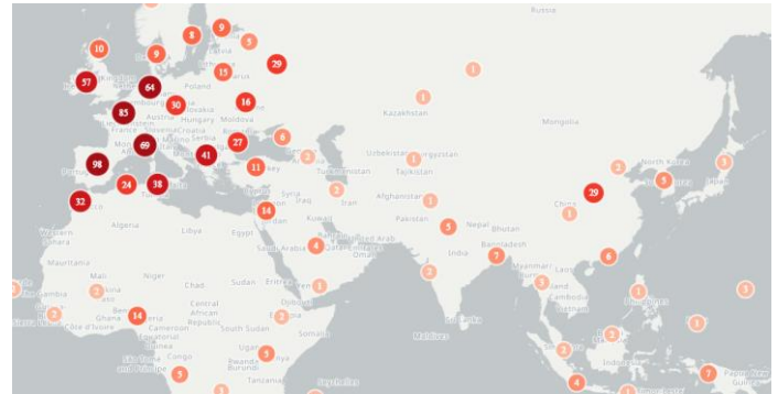
Figure 2 Geolocations mentioned in coronavirus media reports showing clusters of media reports on Italy, France, Spain, Poland, Germany, the UK, Russia, and China (source: EMM/MEDISYS)