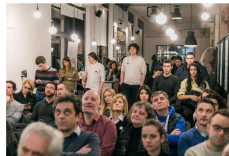
AR VR Machine learning