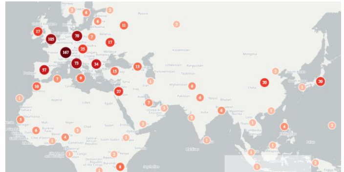
Figure 2 Geolocations mentioned in coronavirus media reports showing clusters of media reports