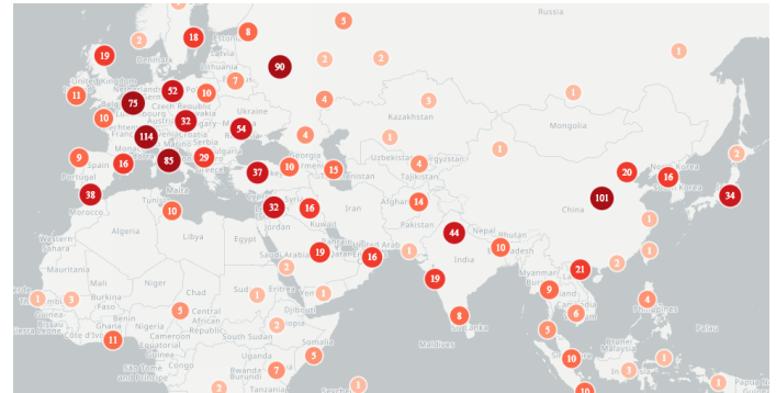
Figure 2 Geolocations mentioned in coronavirus media reports showing large clusters of media reports on Italy, France, Spain, Germany, the UK, Russia, India, China, South Korea and Japan (source: EMM/MEDISYS)