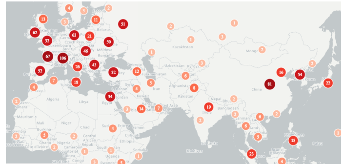
Figure 2 Geolocations mentioned in coronavirus media reports showing large clusters of media reports on Italy, France, Spain, Germany, the UK, Russia, China, South Korea and Japan