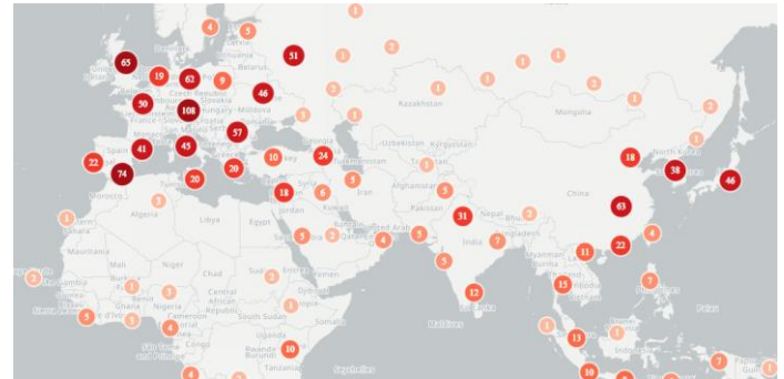
Figure 2 Geolocations mentioned in coronavirus media reports showing clusters of media reports on Italy, France, Spain, Germany, the UK, Russia, Egypt, China, South Korea and Japan