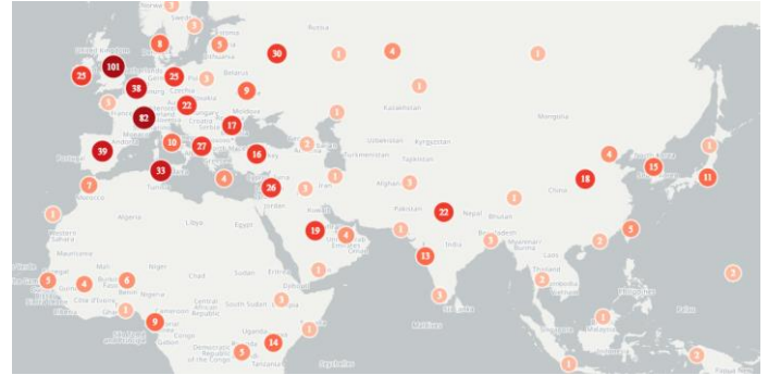
Figure 2 Geolocations mentioned in coronavirus media reports showing clusters of media reports