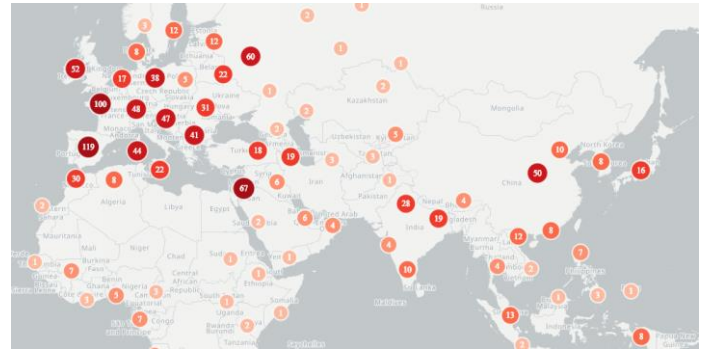
Figure 2 Geolocations mentioned in coronavirus media reports showing clusters of media reports on Italy, France, Spain, Germany, the UK, Russia, India, China, South Korea and Japan