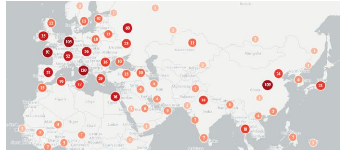
Figure 2 Geolocations mentioned in coronavirus media reports showing large clusters of media reports on Italy, France, Spain, Germany, the UK, Russia, China, South Korea and Japan