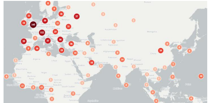
Figure 2 Geolocations mentioned in coronavirus media reports showing clusters of media reports