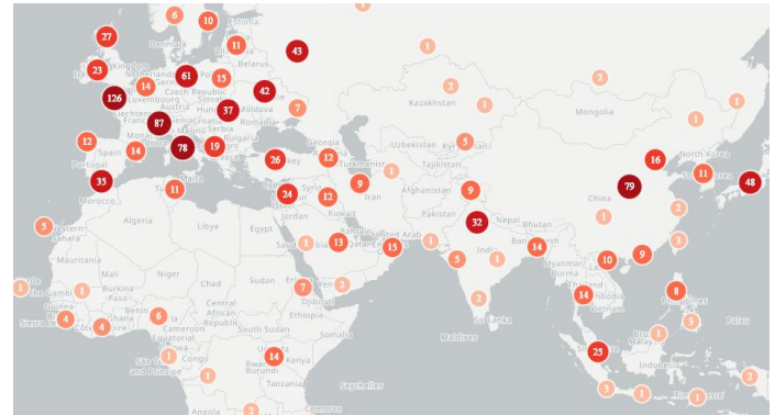
Figure 2 Geolocations mentioned in coronavirus media reports showing large clusters of media reports on Italy, France, Spain, Germany, the UK, Russia, China, South Korea and Japan