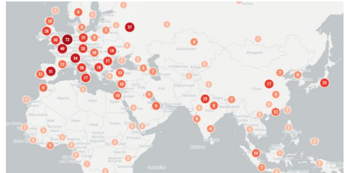
Figure 2 Geolocations mentioned in coronavirus media reports showing clusters of media reports on Italy, France, Spain, Germany, the UK, Russia, Egypt, China, South Korea and Japan