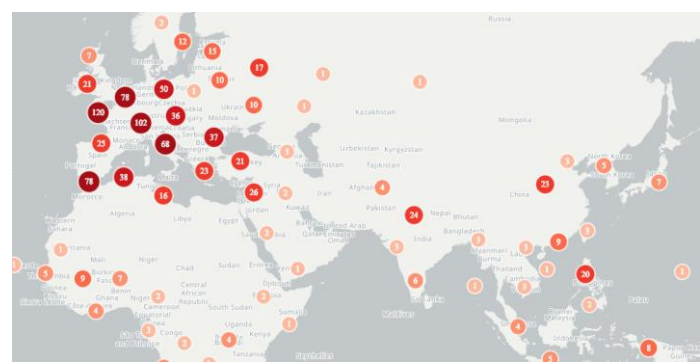
Figure 2 Geolocations mentioned in coronavirus media reports showing clusters of media reports on Italy, France, Spain, Germany, the UK, Russia, India, China, South Korea and Japan