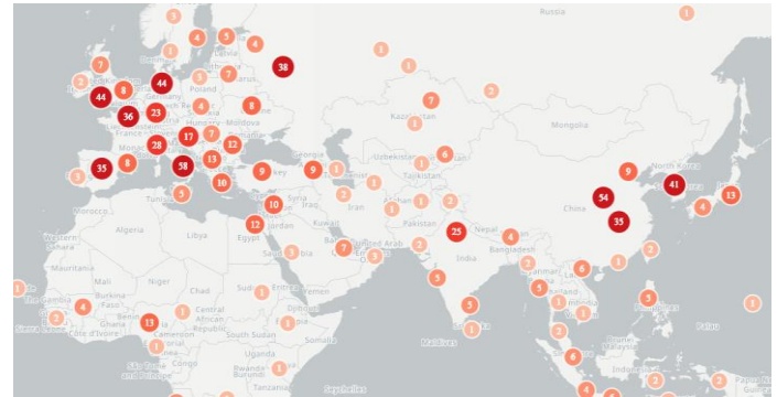
Figure 2 Geolocations mentioned in coronavirus media reports showing large clusters of media reports on Italy, France, Spain, Germany, the UK, Russia, China, South Korea and Japan