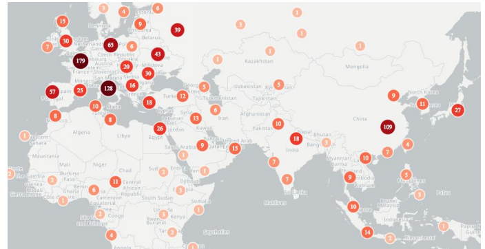
Figure 2 Geolocations mentioned in coronavirus media reports showing large clusters of media reports on Italy, France, Spain, Germany, the UK, Russia, China, South Korea and Japan