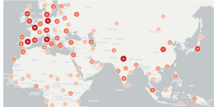
Figure 2 Geolocations mentioned in coronavirus media reports showing clusters of media reports