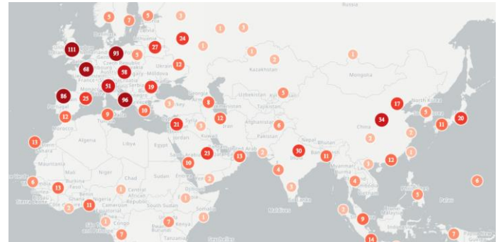
Figure 2 Geolocations mentioned in coronavirus media reports showing clusters of media reports in Italy, France, Spain, Germany, the UK, Russia, Egypt, India, China, South Korea and Japan