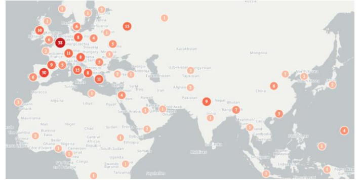
Figure 2 Geolocations mentioned in coronavirus media reports showing clusters of media reports on Italy, France, Spain, Germany, the UK, Russia, India and China