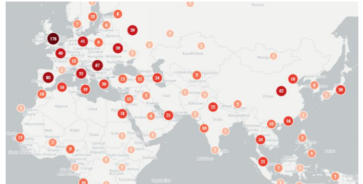
Figure 2 Geolocations mentioned in coronavirus media reports showing clusters of media reports on Italy, France, Spain, Germany, the UK, Russia, Egypt, India, China, South Korea and Japan