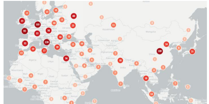
Figure 2 Geolocations mentioned in coronavirus media reports showing large clusters of media reports on Italy, France, Spain, Germany, the UK, Russia, China, South Korea and Japan