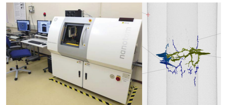
Three-dimensional X-ray tomography represents a powerful tool for the dimensional analysis and the detection of defects in service-exposed materials and components. The example on the right-hand side reveals cracks in a tubular component subjected to thermal fatigue.

The JRC works on nuclear structural materials that can be used in harsh new reactor environments by performing pre-normative research and development (R&D), delivering qualified data into codes and standards, developing novel test techniques, and advanced inspection procedures, which are intended for use in the next generation of reactors.