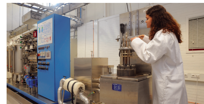
The JRC's AMALIA laboratory investigates the degradation mechanisms of structural materials exposed to light-water reactor environments, and in particular, corrosion and stress-corrosion cracking, which can contribute to ageing.

The JRC performs research in close collaboration with European partners to determine material properties and degradation mechanisms in order to assess safety margins for structural materials, fuel and nuclear components under normal and accident scenarios. The experimental work is conducted in dedicated laboratories that can simulate stress corrosion of reactor components or the behaviour of fuel under irradiation, and it is complemented with modelling and numerical simulation.