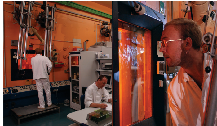
The JRC hot cells facility for the study of nuclear fuel safety. Nuclear fuel safety research involves experiments simulating under normal, transient and accidental conditions, in order to determine the safety limits of nuclear fuel.

Within its unique experimental facilities, the JRC performs research to determine the safety limits of nuclear fuels and cycles under normal/off-normal operating conditions and severe accident scenarios. The final safety objective is to assess mechanical integrity of the fuel assemblies during reactor lifetime and beyond, and fuel response to transient conditions and to severe reactor accident conditions.