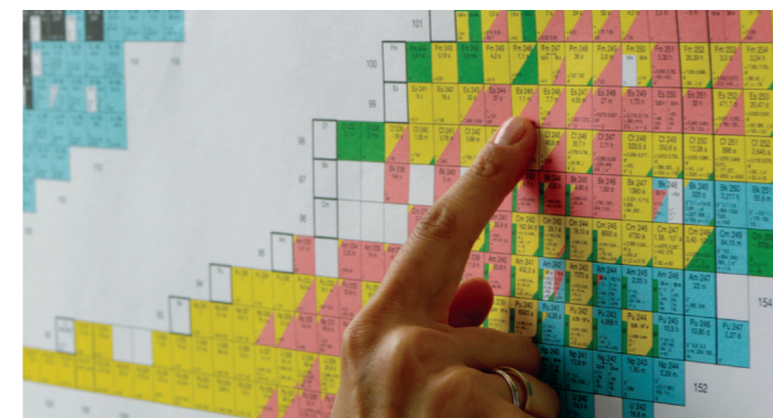
The JRC provides updates of the Karlsruhe Nuclide Chart, a living periodic table displaying all known isotopes of all elements and their radioactive data in a distinctly easy to navigate colour scheme. The Karlsruhe Nuclide Chart has been tracking new elements since 1958 and is the product of a longstanding partnership between the JRC and Karlsruhe Institute of Technology.

The JRC's current education and training efforts can be grouped into three major activities: the management of nuclear expert knowledge, the contribution to the European E&T activities by hosting students and organising internships and specialised training courses in the fields of nuclear safety, safeguards, security and forensics, and the monitoring of human resources' development in the nuclear field in Europe.