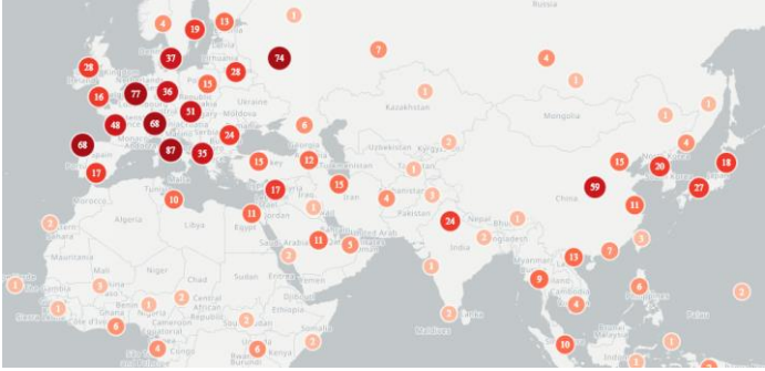
Figure 2 Geolocations mentioned in coronavirus media reports showing large clusters of media reports on Italy, France, Spain, Germany, the UK, Russia, China, South Korea and Japan