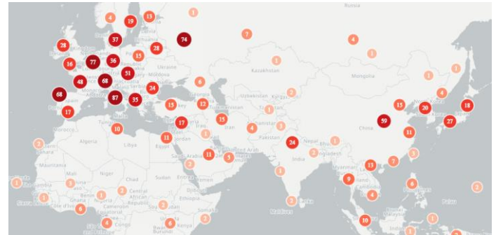
Figure 2 Geolocations mentioned in coronavirus media reports showing large clusters of media reports on Italy, France, Spain, Germany, the UK, Russia, China, South Korea and Japan