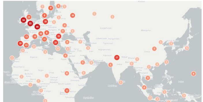
Figure 2 Geolocations mentioned in coronavirus media reports showing clusters of media reports on Italy, France, Spain, Portugal, Greece, Germany, Ireland, the UK, Russia, and India