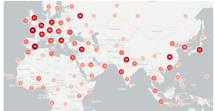
Figure 2 Geolocations mentioned in coronavirus media reports showing clusters of media reports on Italy, France, Spain, Germany, the UK, Russia, Egypt, China, South Korea and Japan