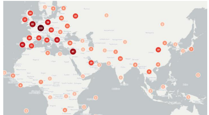
Figure 2 Geolocations mentioned in coronavirus media reports showing clusters of media reports