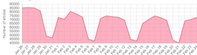
Figure 1 Media reports on Covid-19

Coronavirus disease 2019 (COVID-19) caused by severe acute respiratory syndrome coronavirus 2 (SARS-CoV-2) remains a mayor news topic, with over 70 thousand articles per day (in 70 languages, as detected by EMM/MEDISYS ).