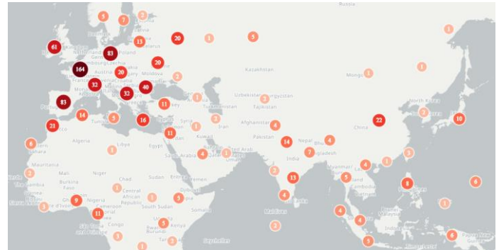
Figure 2 Geolocations mentioned in coronavirus media reports showing clusters of media reports on Italy, France, Spain, Poland, Germany, the UK, Russia, India and China