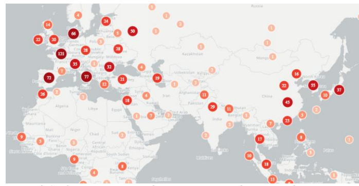
Figure 2 Geolocations mentioned in coronavirus media reports showing clusters of media reports on Italy, France, Spain, Germany, the UK, Russia, Egypt, China, South Korea and Japan