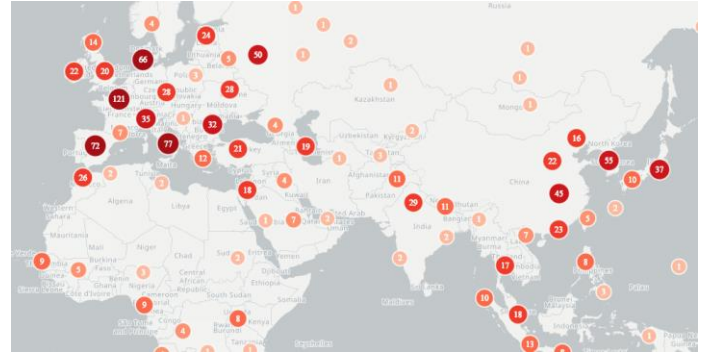
Figure 2 Geolocations mentioned in coronavirus media reports showing clusters of media reports on Italy, France, Spain, Germany, the UK, Russia, Egypt, China, South Korea and Japan