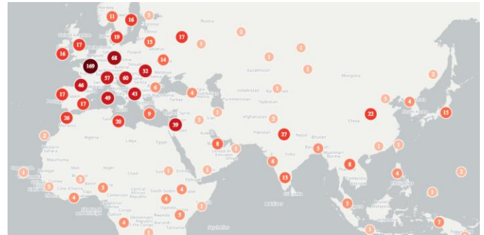
Figure 2 Geolocations mentioned in coronavirus media reports showing clusters of media reports