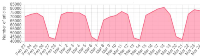
Figure 1 Media reports on Covid-19

Coronavirus disease 2019 (COVID-19) caused by severe acute respiratory syndrome coronavirus 2 (SARS-CoV-2) remains a major news topic, with over 70 thousand articles per day (in 70 languages, as detected by EMM/MEDISYS ).