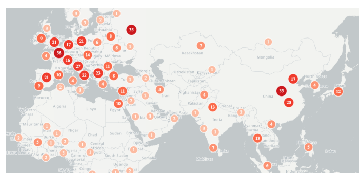
Figure 2 Geolocations mentioned in coronavirus media reports showing large clusters of media reports on Italy, France, Spain, Germany, the UK, Russia, China, South Korea and Japan