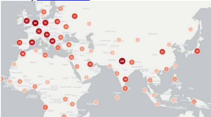
Figure 1 Geolocations mentioned in coronavirus media reports showing clusters of media reports (source: EMM/MEDISYS)

Coronavirus disease 2019 (COVID-19) caused by severe acute respiratory syndrome coronavirus 2 (SARS-CoV-2) remains a mayor news topic, with over 70 thousand articles per day (in 70 languages, as detected by EMM/MEDISYS ).