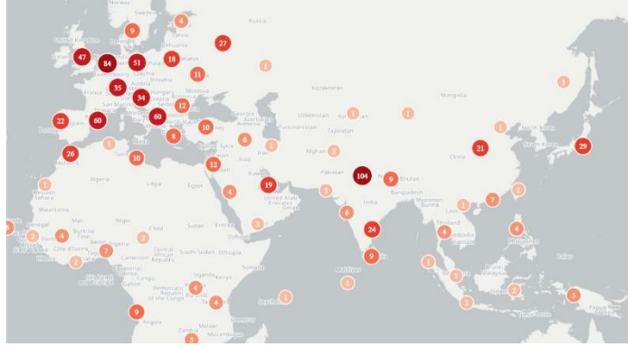
Figure 1 Geolocations mentioned in coronavirus media reports showing clusters of media reports (source: EMM/MEDISYS)

Coronavirus disease 2019 (COVID-19) caused by severe acute respiratory syndrome coronavirus 2 (SARS-CoV-2) remains a mayor news topic, with over 70 thousand articles per day (in 70 languages, as detected by EMM/MEDISYS).