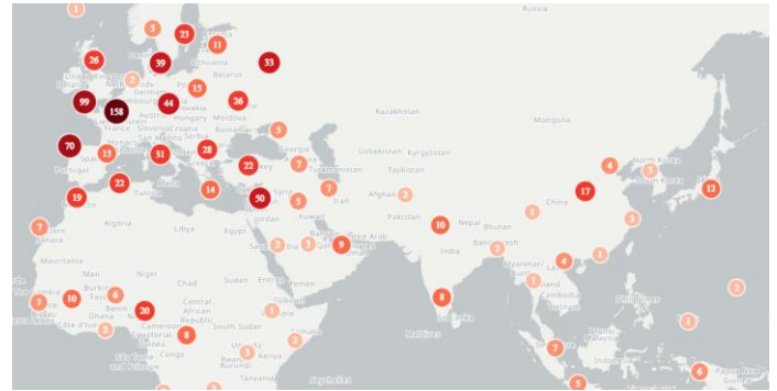
Figure 2 Geolocations mentioned in coronavirus media reports showing clusters of media reports